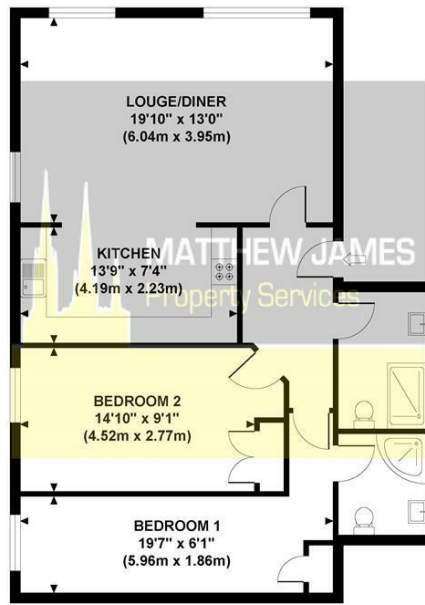
GROUND FLOOR GROSS INTERNAL FLOOR AREA 814 SQ FT

Although every attempt has been made to ensure accuracy, all measurements are approximate and no responsibility is taken for any error, omission, or mid-statement. This floor plan is for illustrative purposes only and not to scale. Measured in accordance to RICS standards.